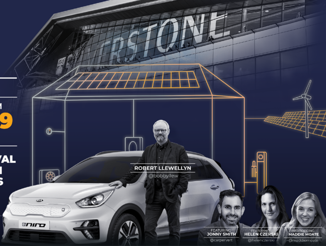
ROBERT LLEWELLYN @bobbyllew